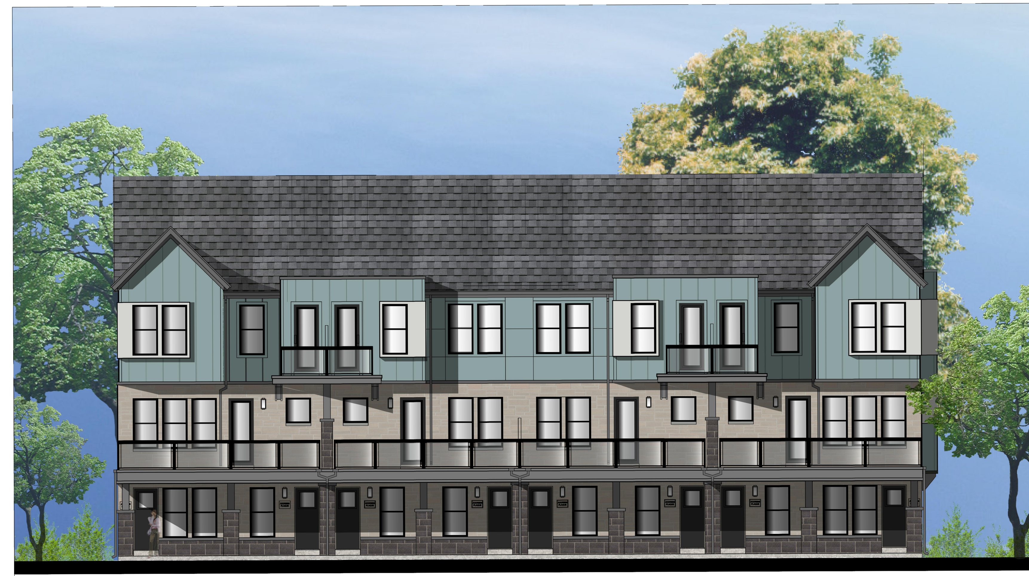
CONCEPTUAL TYPICAL ELEVATION (DANIEL STREET)

THESE DRAWINGS ARE NOT TO BE SCALED. ALL DIMENSIONS MUST BE VERIFIED BY CONTRACTOR PRIOR TO COMMENCEMENT OF ANY WORK. ANY DISCREPANCIES MUST BE REPORTED DIRECTLY TO SRN ARCHITECTS INC.