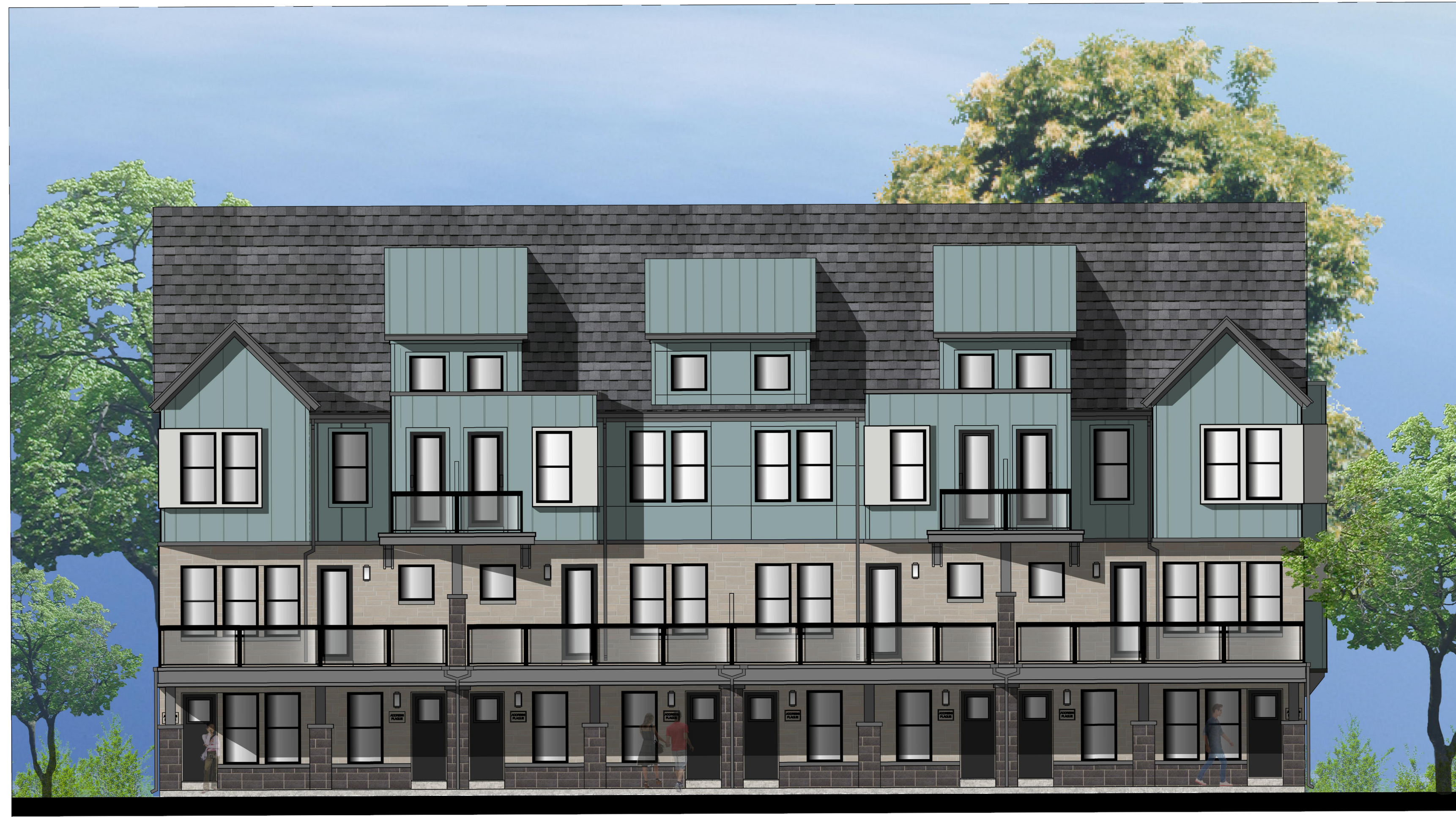
CONCEPTUAL TYPICAL ELEVATION